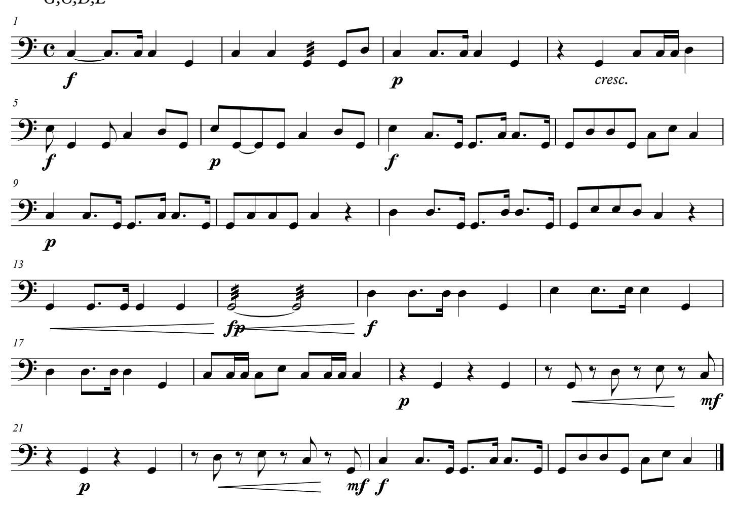
Track 3: Etude - Don Neptun, Timpani Etude No. 1 from ALL HANDS Percussion Curriculum Moderato = 88 G,C,D,E

Please prepare the following excerpt on timpani (you will need to be able to demonstrate your ability to tune timpani):